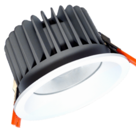
Bandera Pro is a range of quality commercial LED downlights

Hilclare use the latest technology to design and specify bespoke lighting solutions and manufacture industrial and commercial luminaires of the highest quality, in a state-of-the-art UK facility.